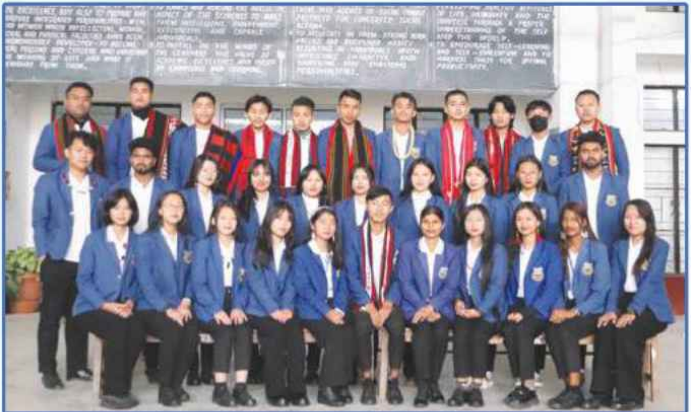
B. Com 4 th Semester