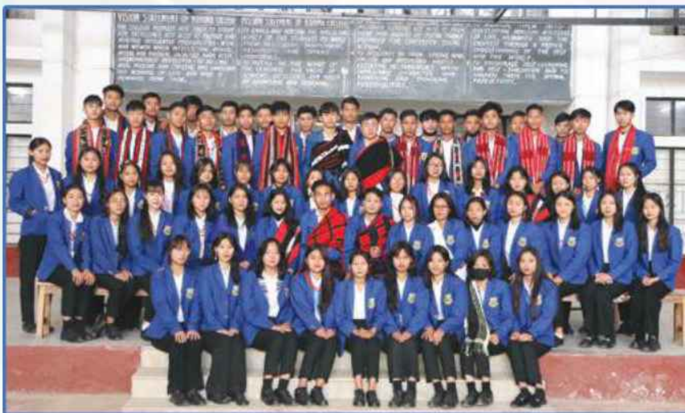
BA 2 nd Semester Education Department