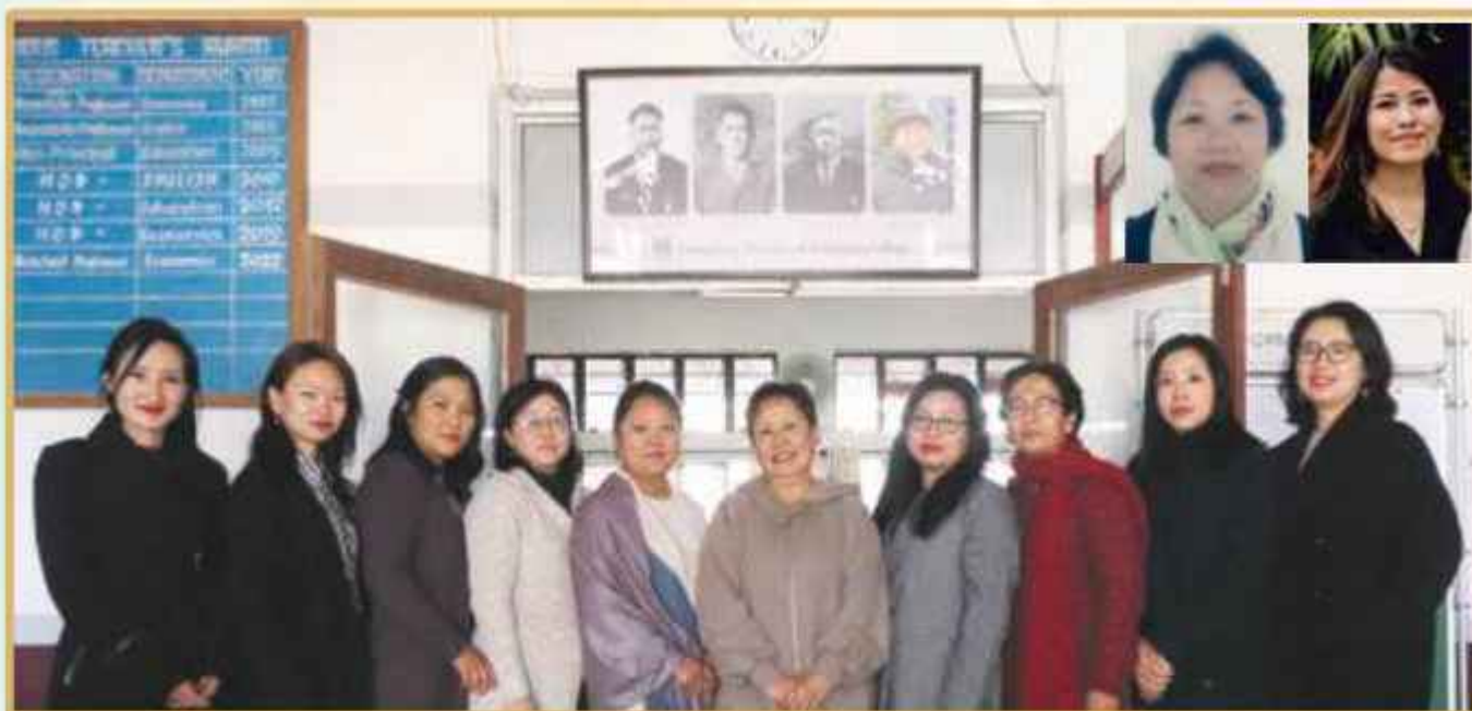
Department of English