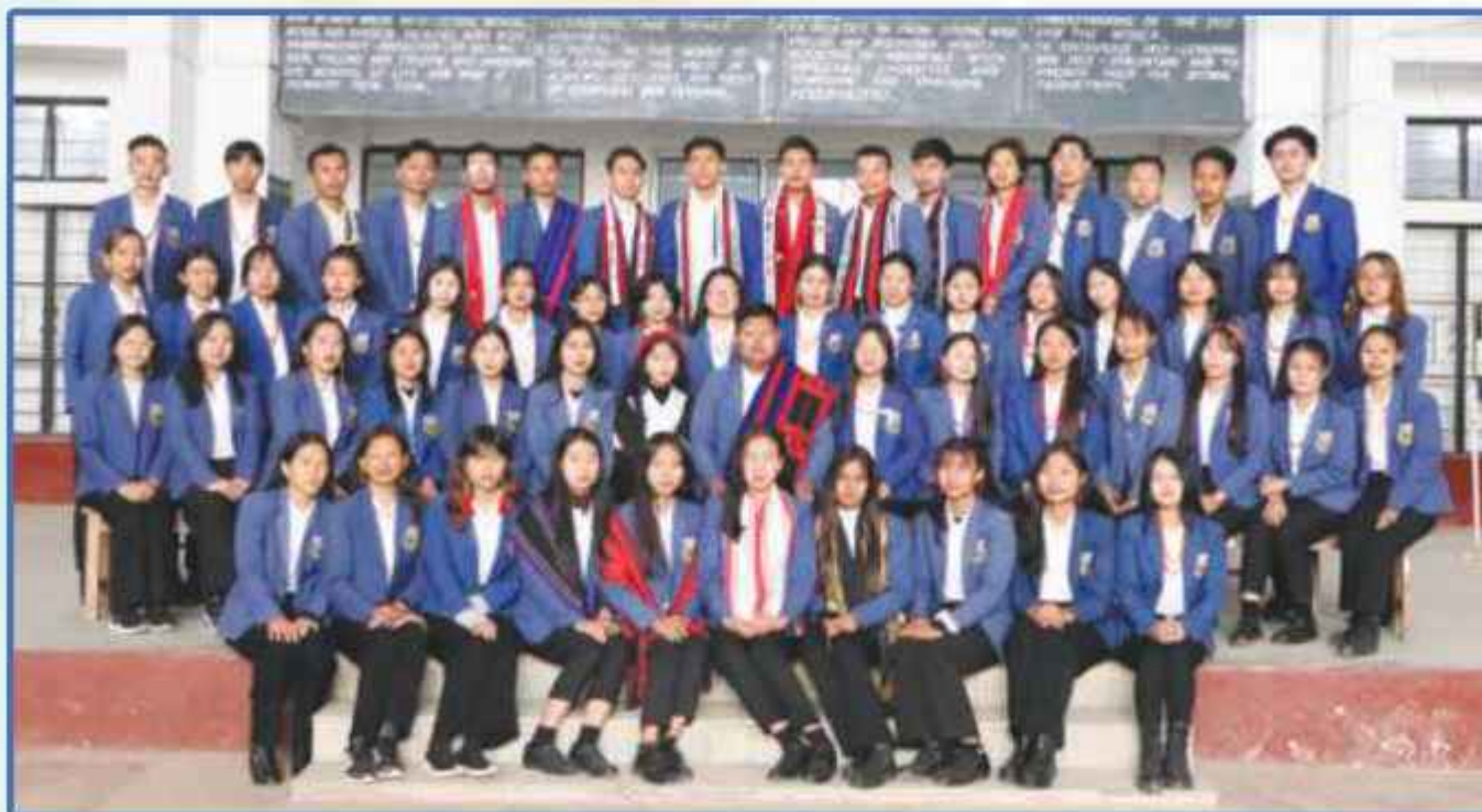
BA 6 th Semester Section A