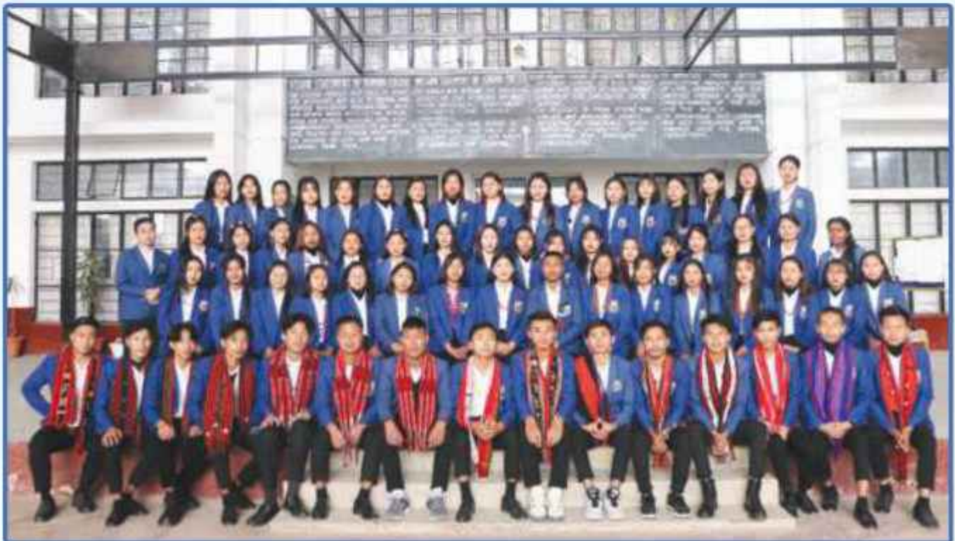
BA 4 th Semester Education Department