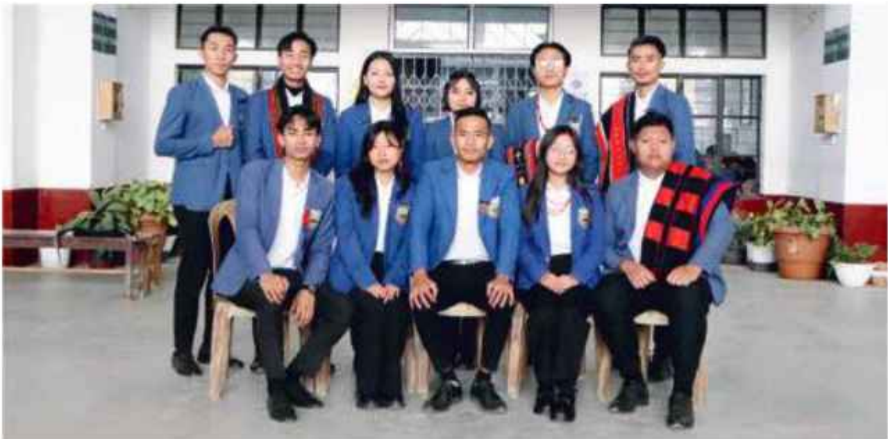
KCSC Executive Members