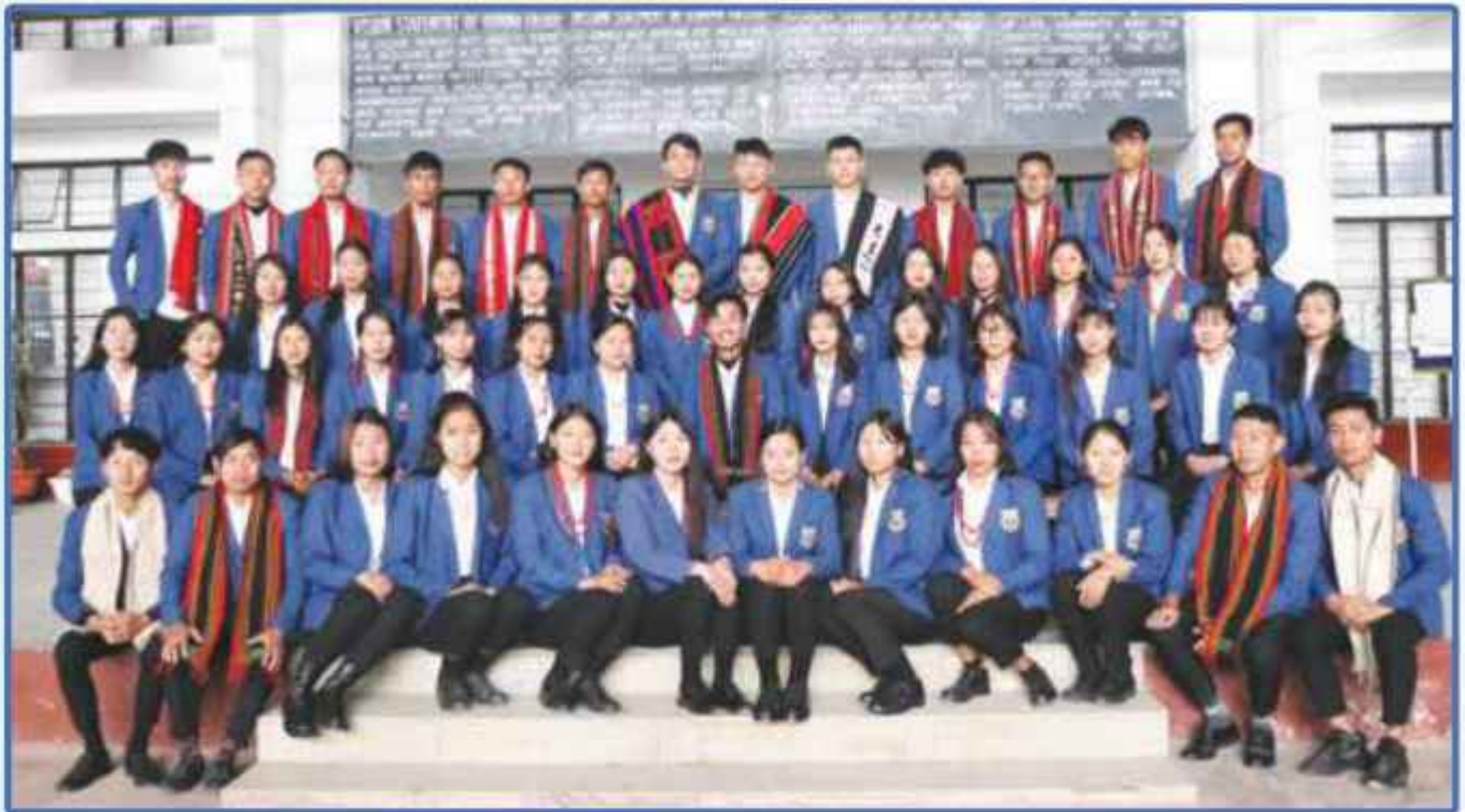
BA 4 th Semester Tenyidie Department