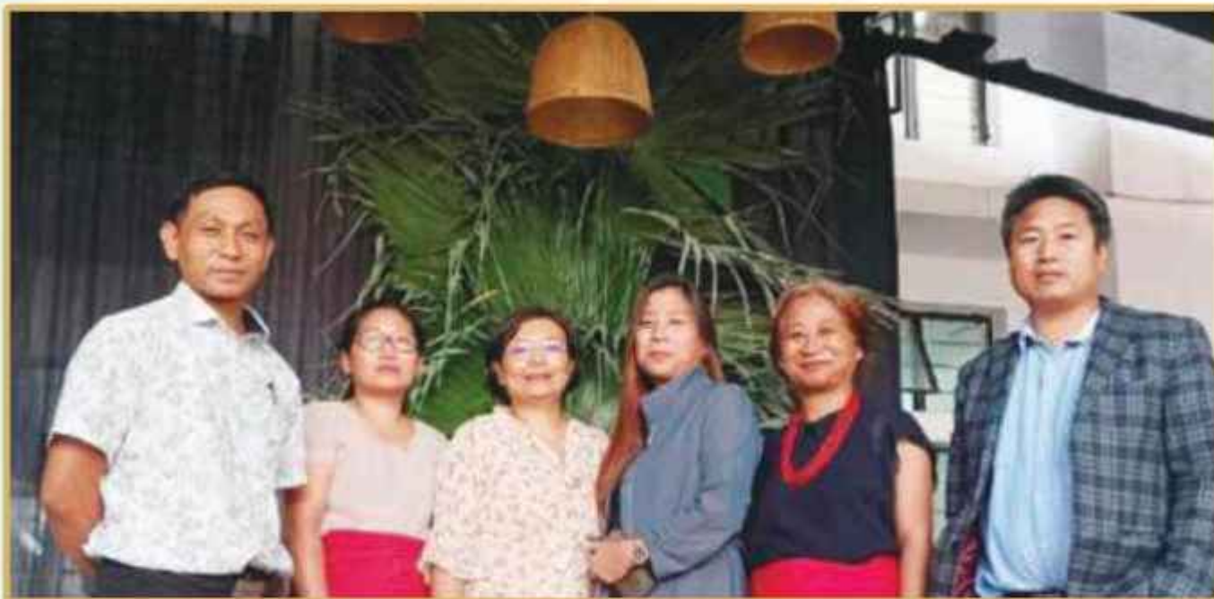
Department of Economics