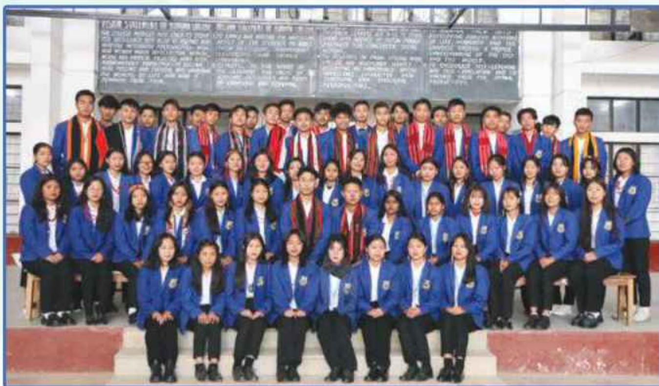
BA 2 nd Semester History Department