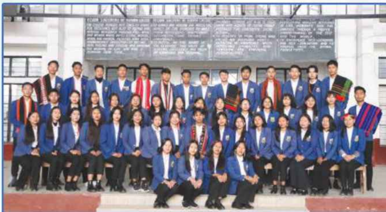
BA 6 th Semester Section B