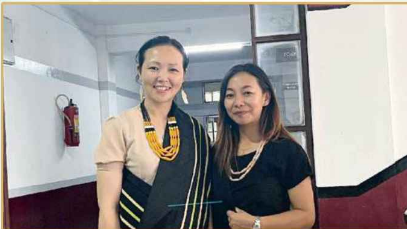
Department of Environmental Science