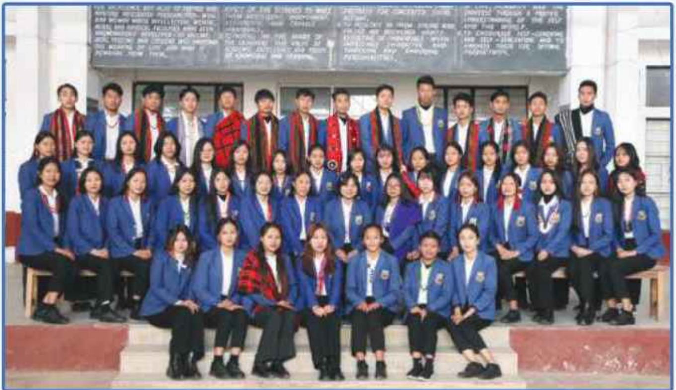
BA 4 th Semester Sociology Department