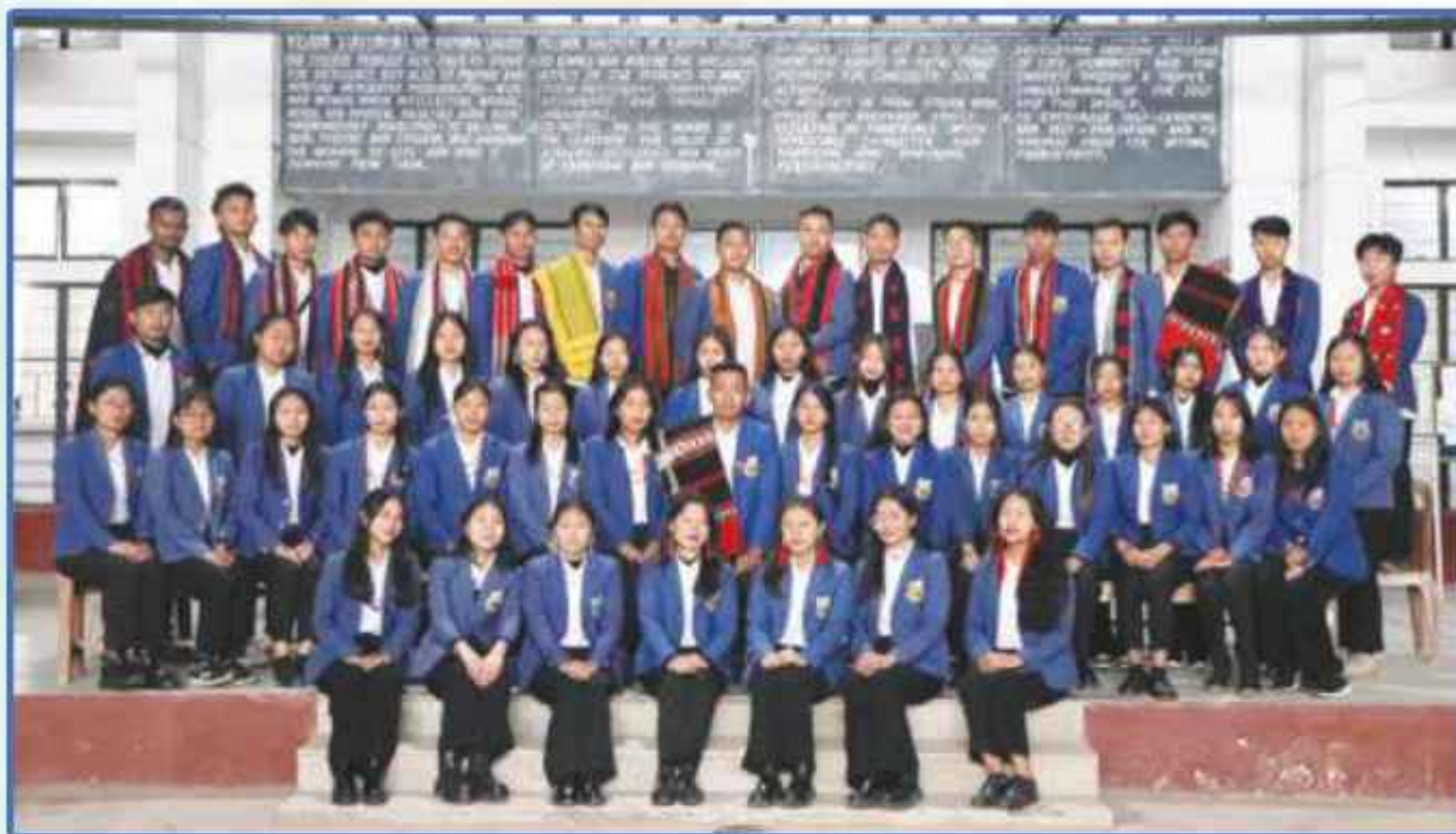
BA 6 th Semester Section C