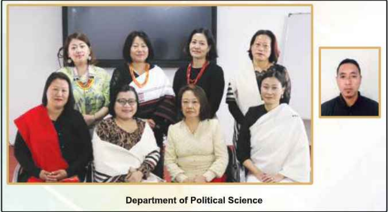
Department of Political Science