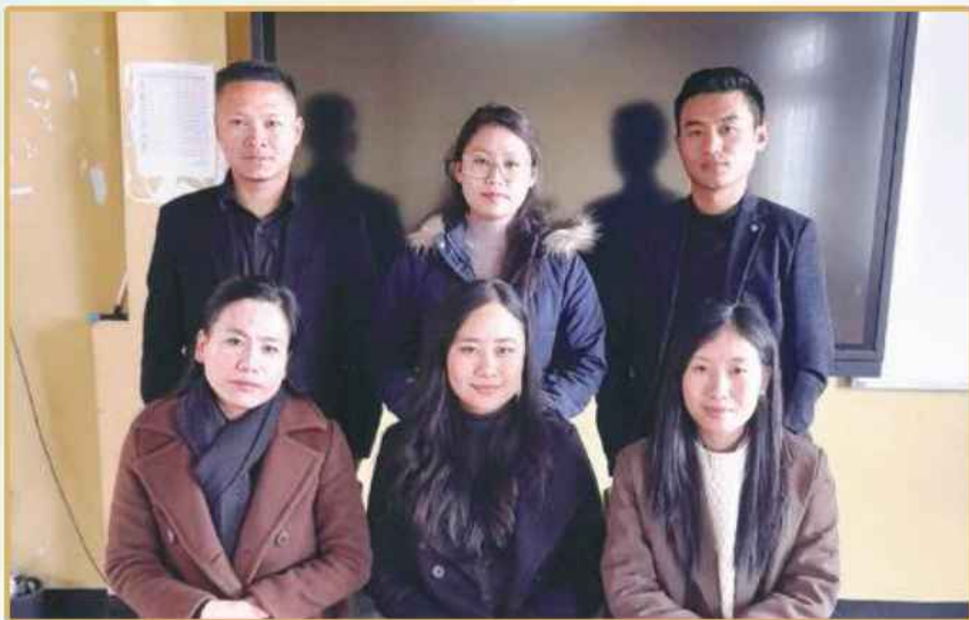
Department of Commerce