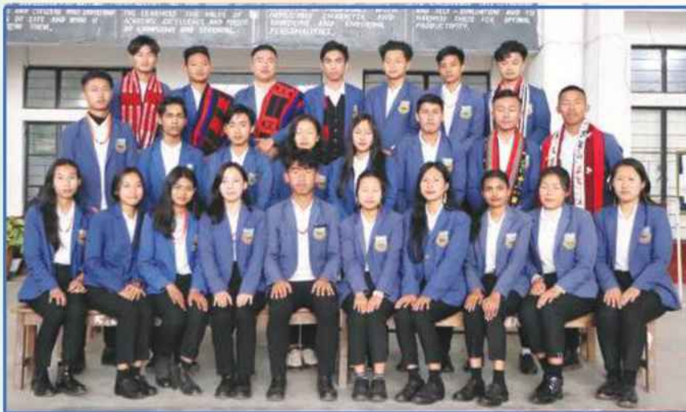
B. Com 6 th Semester