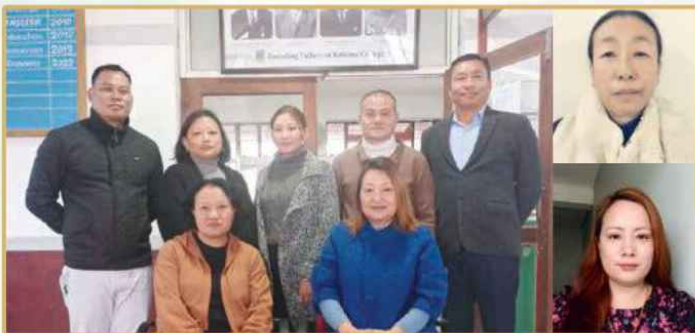
Department of Education