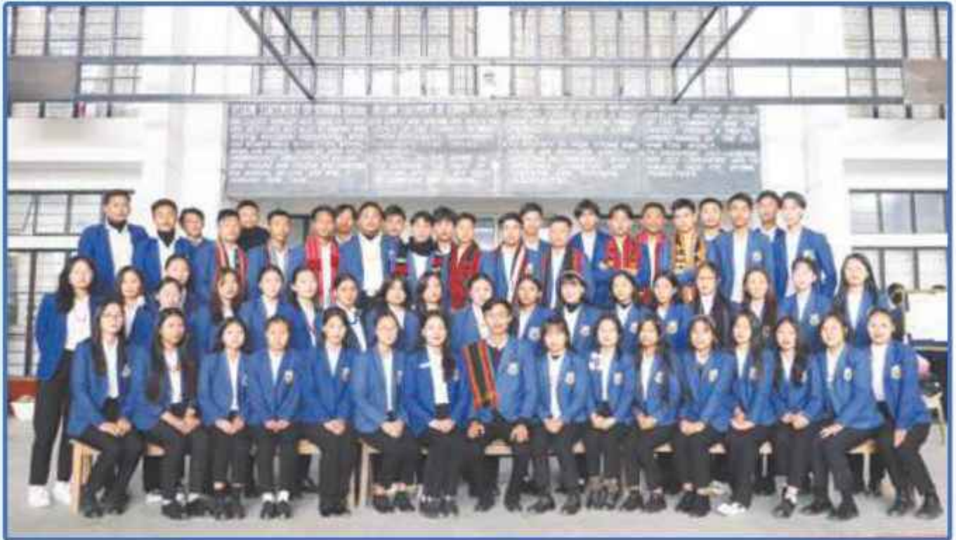
BA 4 th Semester Political Science Department