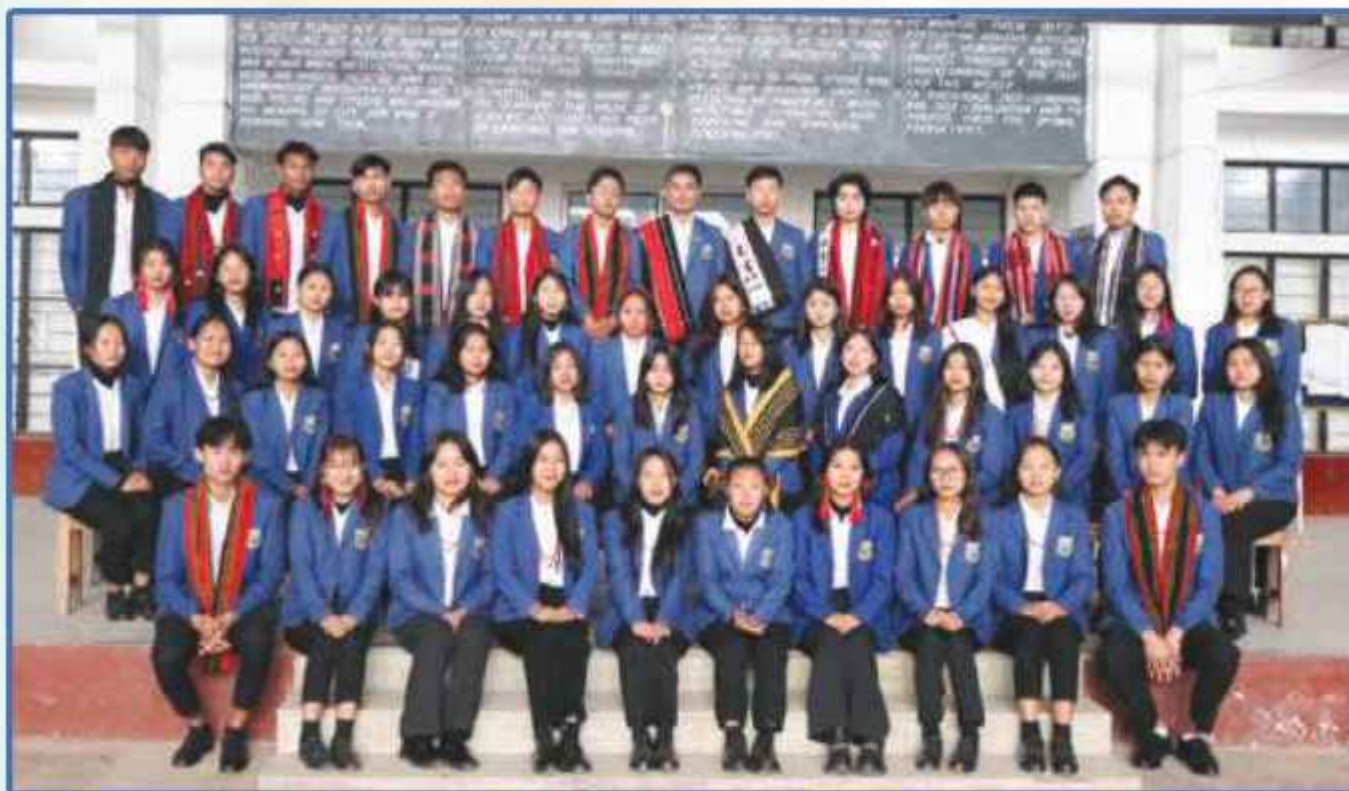
BA 4 th Semester English Department