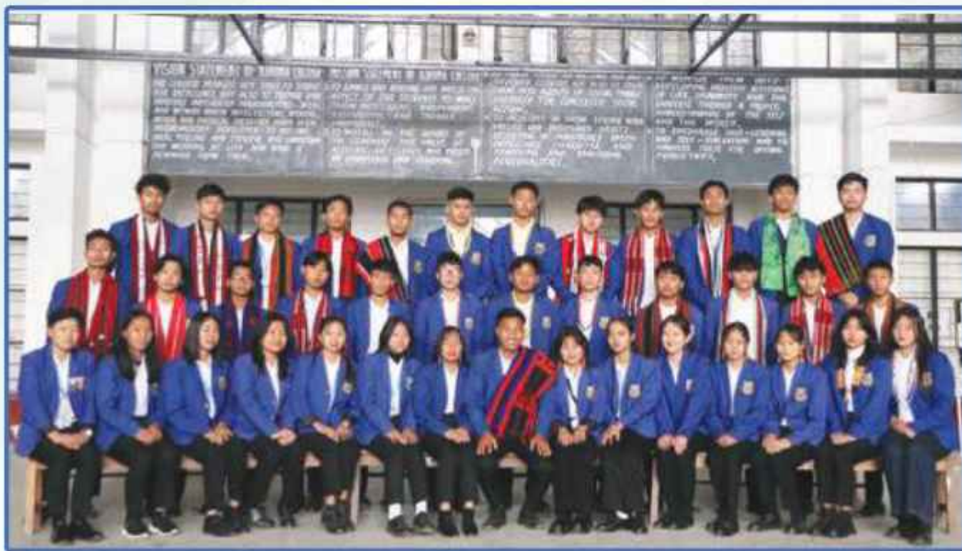
B. Com 2 nd Semester