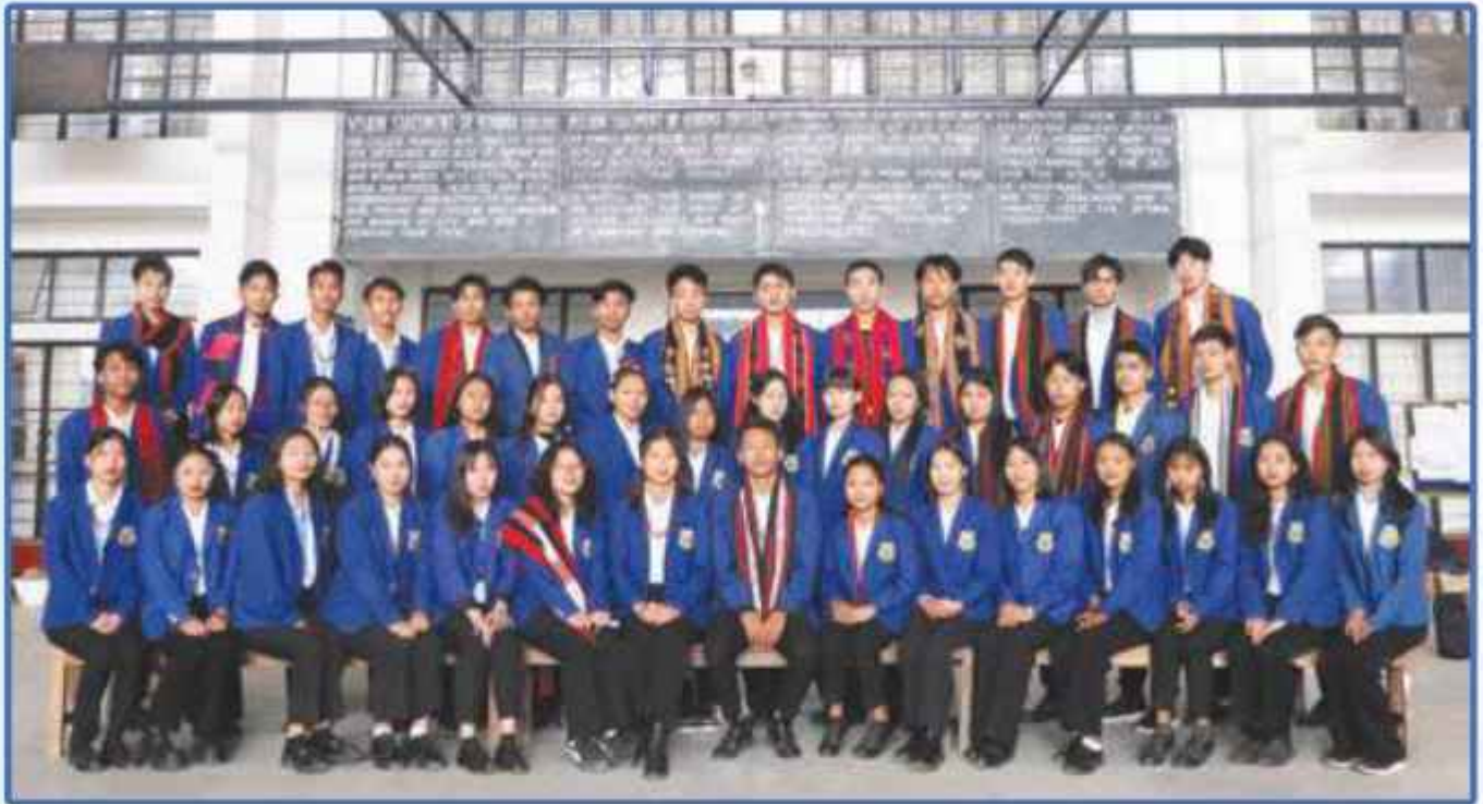
BA 2 nd Semester Political Science Department