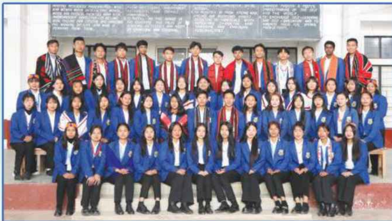
BA 2 nd Semester English Department