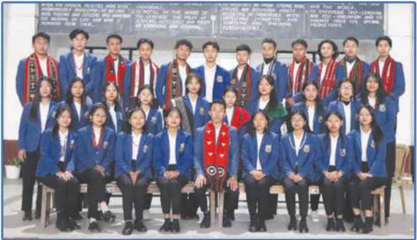
BA 4 th Semester Economics Department