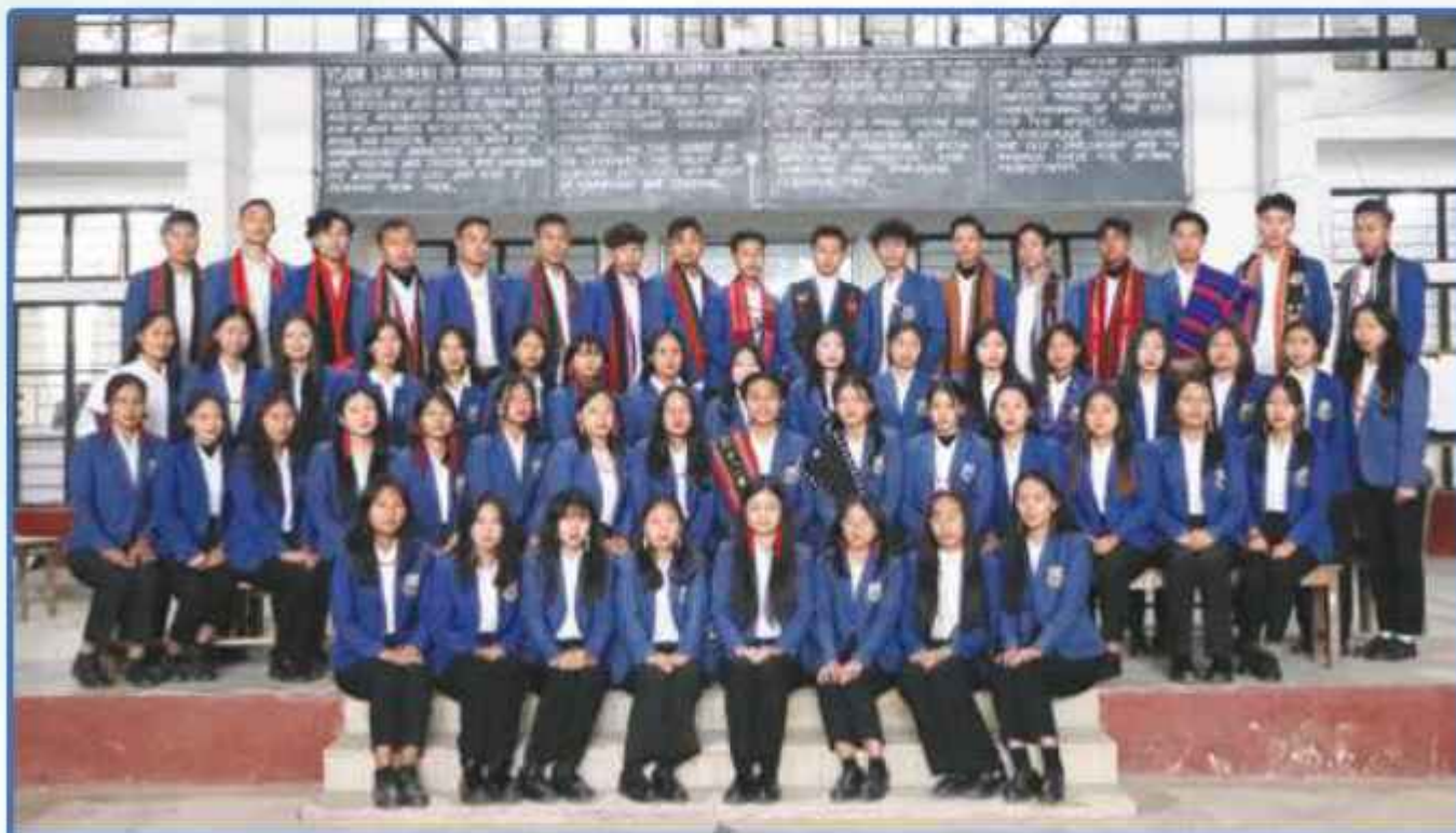
BA 4 th Semester History Department