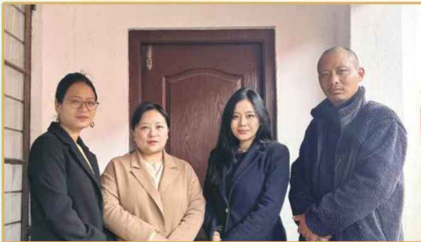
Department of Functional English