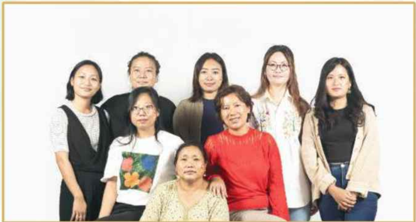
Department of Sociology