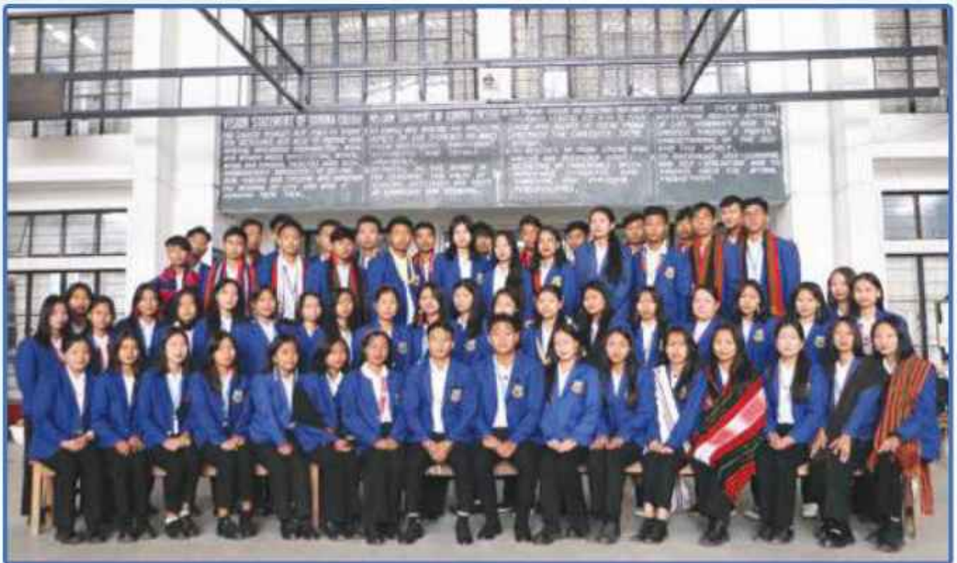
BA 2 nd Semester Sociology Department