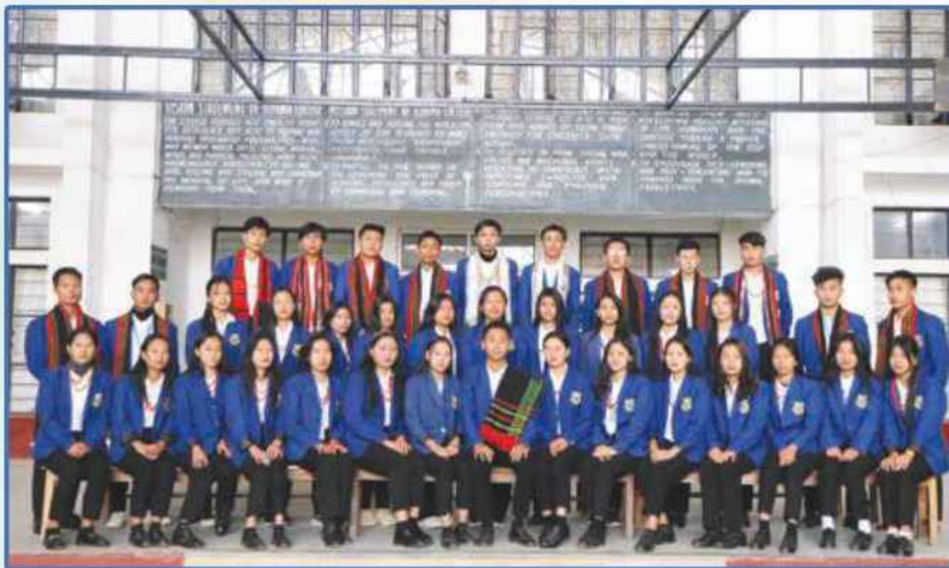
BA 2 nd Semester Tenyidie Department