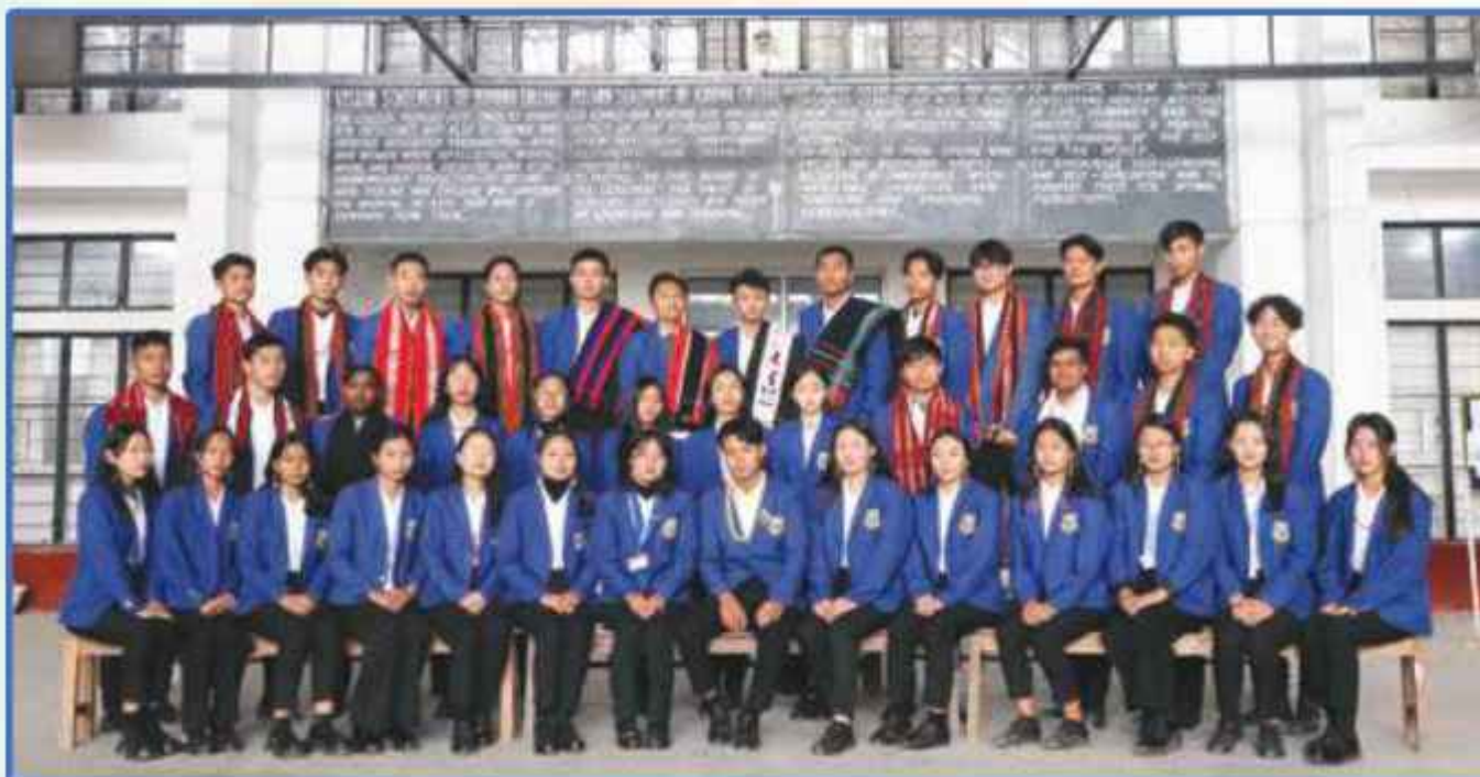
BA 2nd Semester Economics Department