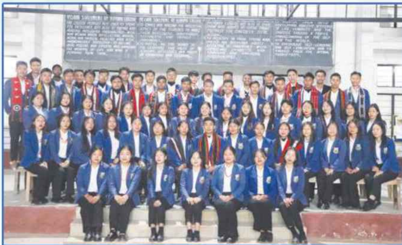
BA 6 th Semester Section D