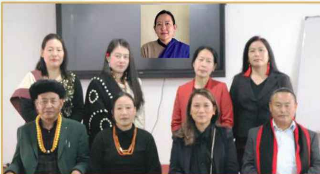
Department of History