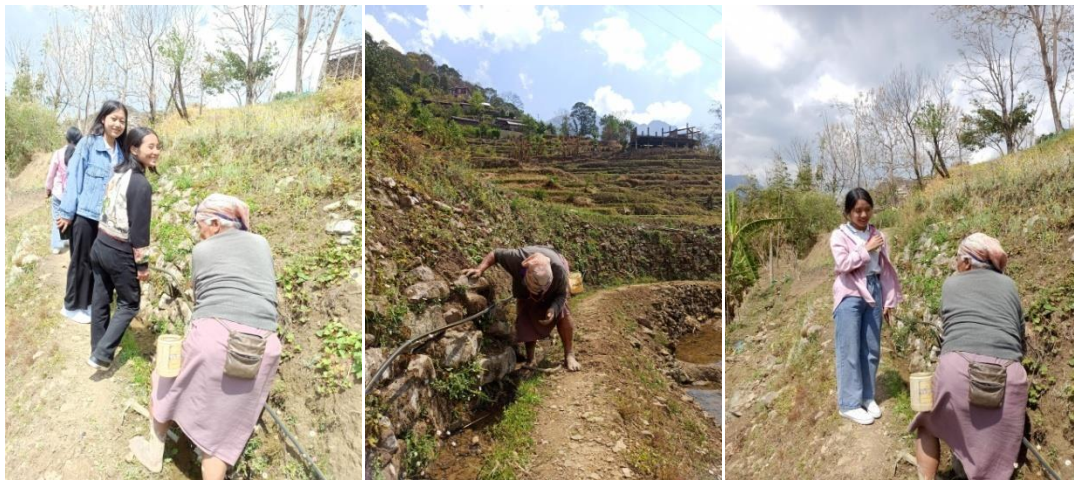
Pic: Student's interacting with the farmers in the field.

The field trip to Khonoma was a very educative day as well as something which we enjoyed a lot. We spent half of the day exploring and learning about Khonoma and its environment. We have heard about the place very often but the field trip and on-ground study of the place just gave a different insight of the environmental-oriented village. It has obviously opened our eyes to the efforts of conservation the people practiced and how it is done. We were also very fortunate to make a quick stop exploring the village and the beauty of the village is indeed surreal. The roads in the village were constructed with fine rocks and the people were very hygienic. It was truly an enjoyable, memorable and very educational trip for each and everyone of us.