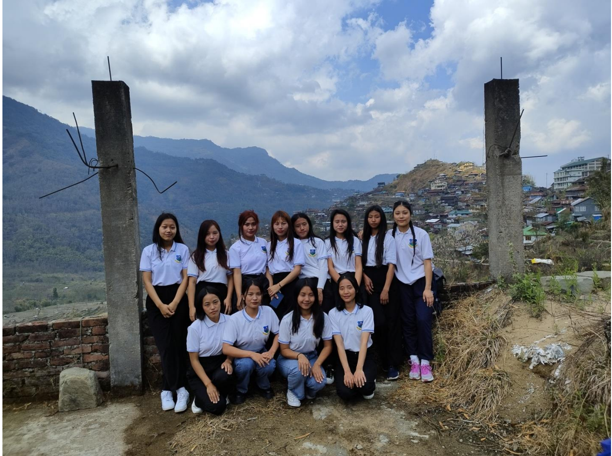
GROUP SIX (TEAM VALUES OF BIODIVERSITY)