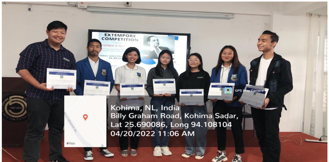
Participants of the Extempore Speech competition on 'Life and Philosophy of BR Ambedkar' organized by the Political Science department as part of the AzadiKaAmritMahotsav celebration.