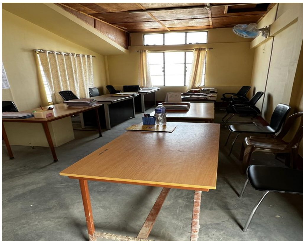
a. Staff Room