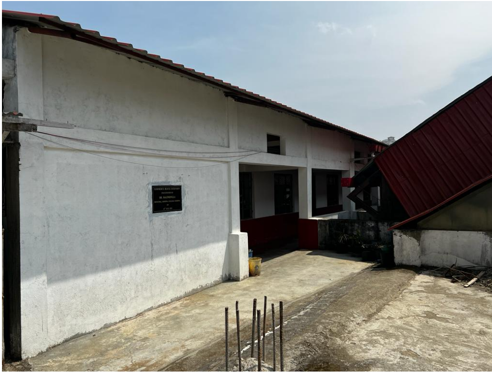
b. Commerce class room