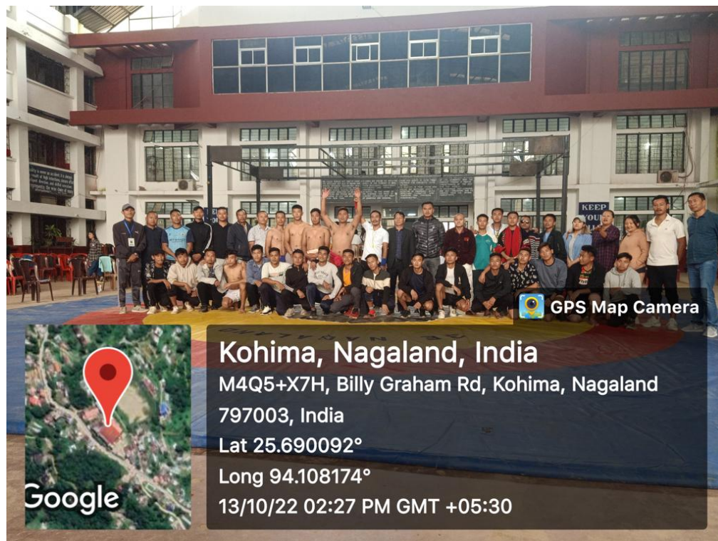
Principal, KCK, along with the match officials, faculty and participants during the wrestling meet on 13 th October at the college courtyard.