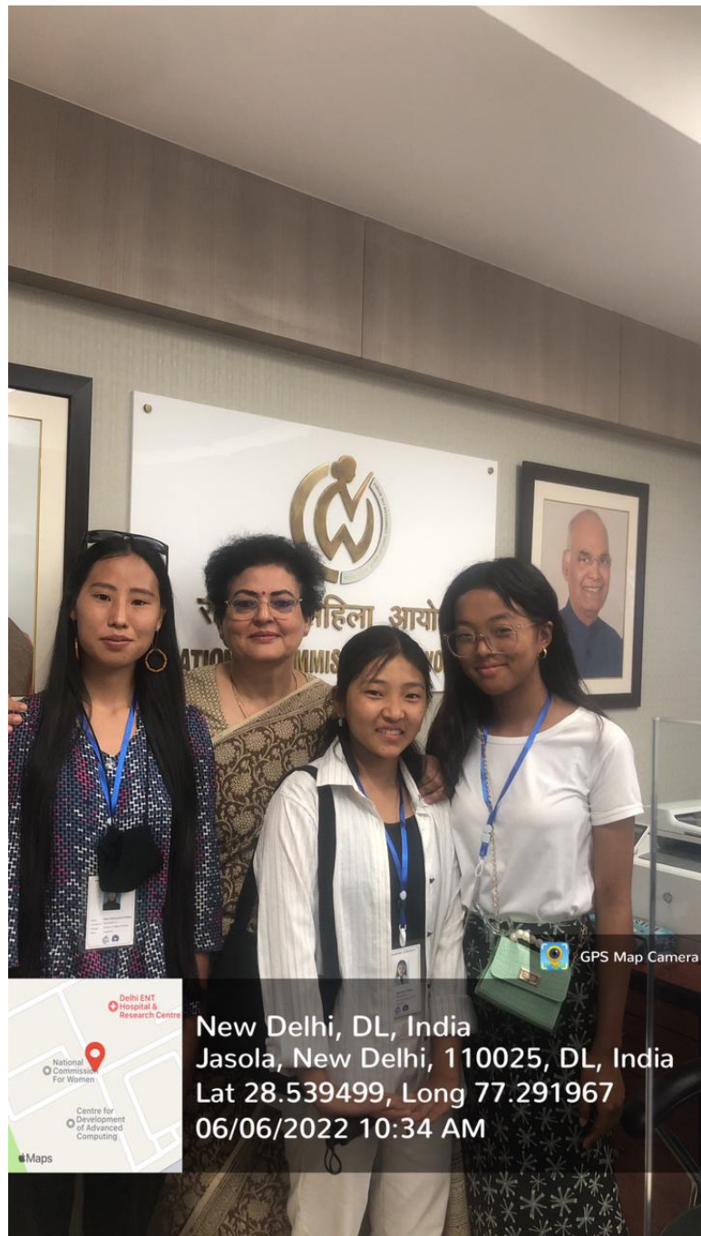
The three students of the college with Smti.Rekha Sharma, the chairperson of National Commission for Women at New Delhi during the exposure trip sponsored by the National Commission for Women, Govt. of India.