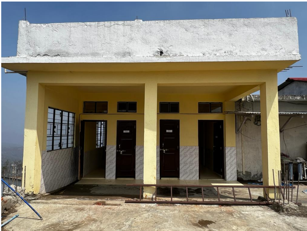
c. Toilet in the commerce block