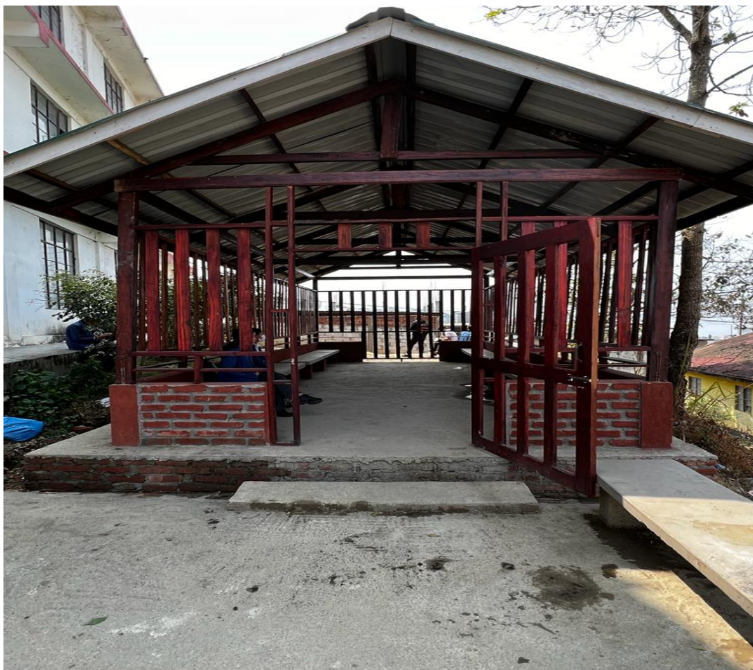
Girls common room/ recreation room